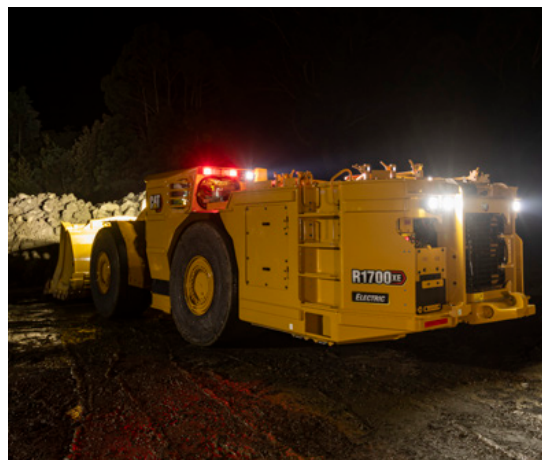
Cat R1700 XE battery electric, zero-exhaust emissions underground mining Load Haul Dump (LHD) with onboard battery

increasingly wide range of fuels, including renewable fuels, biodiesels, biogas, hydrogen blends and HVO. We also continue to invest in power sources that offer lower emissions without sacrificing performance. To support our customers' climate-related objectives, Caterpillar offers modern engines and drive trains equipped with the latest technologies that improve fuel efficiency, reduce emissions and translate into cost savings for our customers.