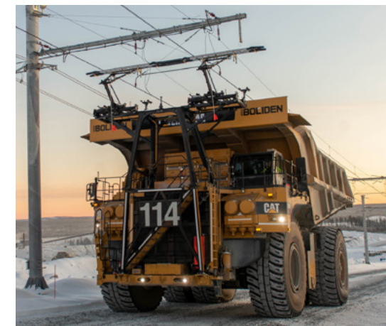
Cat 795 AC mining truck on trolley assist

Caterpillar demonstrated our first battery electric 793 large mining truck prototype, operated fully loaded at its rated capacity in a live demonstration with key mining customers in November 2022. Our electric Cat R1700 XE LHD offers 100% battery electric propulsion, producing zero-exhaust emissions for underground mining operations. Our CI segment is expanding its product portfolio and displayed four battery-powered electric machines in October 2022. Our E&T segment has initiated numerous sustainability innovations covering a range of technologies through both organic and inorganic growth and development, including the acquisition of CarbonPoint Solutions, which provides customers access to carbon capture solutions. Caterpillar also offers Cat Energy Storage System, or ESS, a rapidly deployable electric power solution to help customers integrate multiple power sources on a worksite. Cat ESS can provide grid stabilization, transient assist and renewable energy storage. Learn more about Caterpillar's sustainability-related product innovations and solutions .